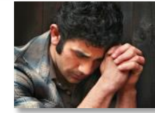
Gather and Pray

(Please note we are unable to distribute items that are marked out of date.)