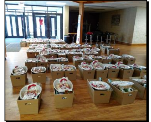
88 dinners ready to be delivered!

“The stories of grateful tears, the prayers shared with those who received a box and the utter joy from the recipients are what make Ted the Turkey so incredibly